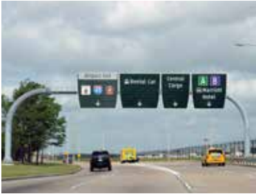
Houston, TX - Airport TXDOT Roadway Signage

Bradlink LLC helps Project Owners, Large Civil Design, Contractors and OEM's work effectively and efficient in building roads, bridges, utilities and tolling infrastructure in the Houston and surrounding areas. We have a proven technical design and field staff capable of handling small to complex large tasks for private and government clients. We are committed to serving with excellence in completing assigned work.