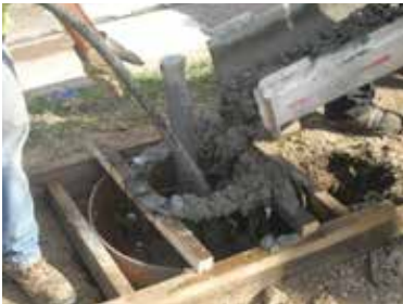
Houston, TX - Drilled Shafts Inspection