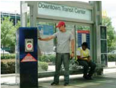
Houston, TX - Light Rail Fiber / Fare Collections